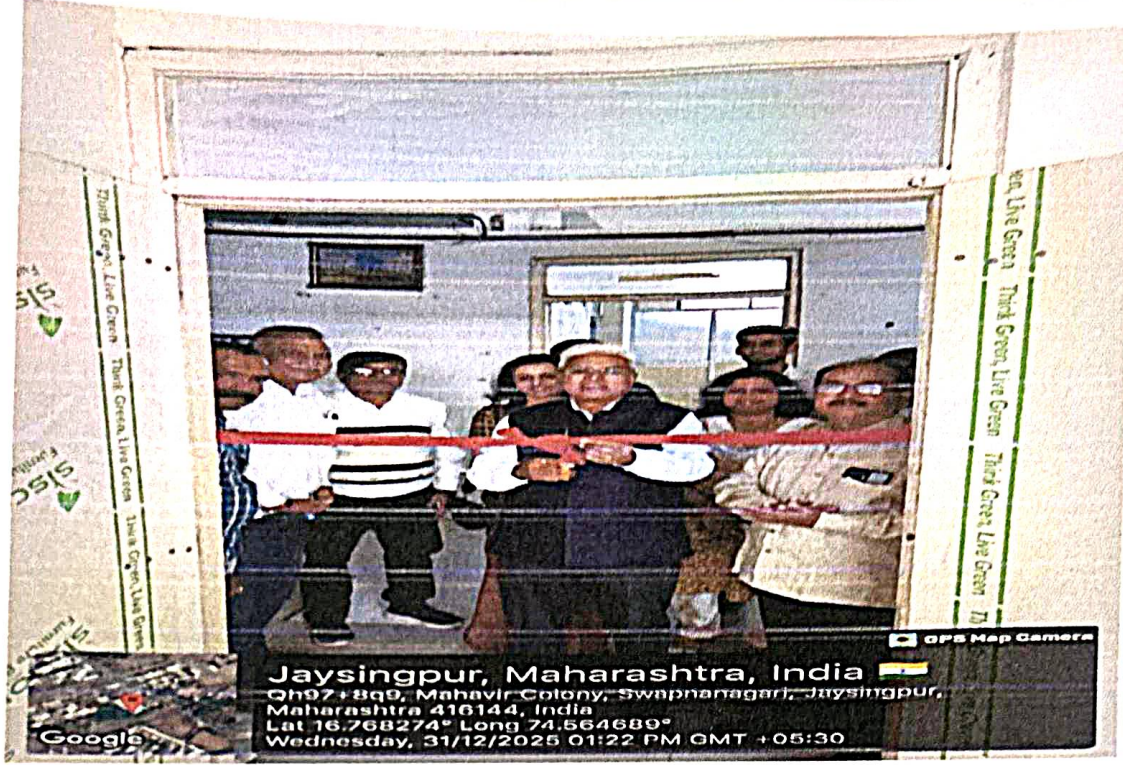
Blood Donation Camp on 31/12/2025